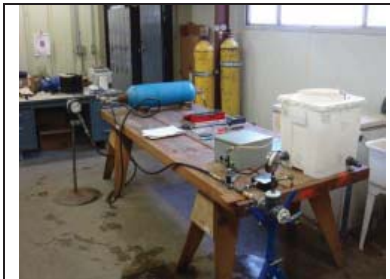
Figure 1. Test bench general arrangement