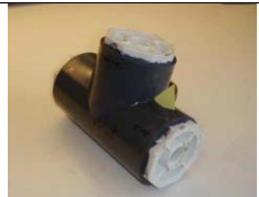
Figure 3. Failure crack in a 2-in. Schedule 80 tee

Figure 2 also shows a Surge Guard PVC tee installed in the test jig. The tee sockets are fitted with schedule 40 2-in. x 1/2-in. reducer bushings (SP x F). The solvent welding was accomplished using IPS P70 primer and IPS 711 solvent cement. A pressure gauge is fitted into the vertical connection. A ball valve is fitted into the downstream port and is used to vent the air in the system. During the test, the lab room temperature was kept between 60° and 65° F. The failure crack shown in Figure 3 is representative of the location noted in all test work.