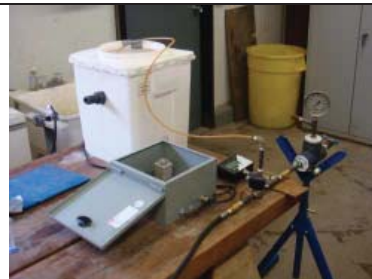
Figure 2. 2-in. Surge Guard PVC tee installed in the test jig with related components