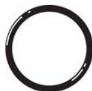
Buna-N (Nitrile) (Current style)