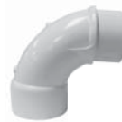
Slip x SP