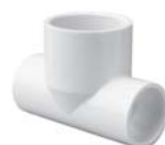
Slip x Slip x Slip