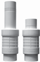
Slip x Spigot