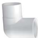
SP x Slip