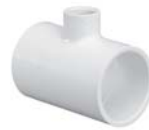
Slip x Slip x Slip