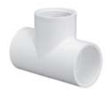
Slip x Slip x FPT