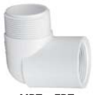
MPT x FPT